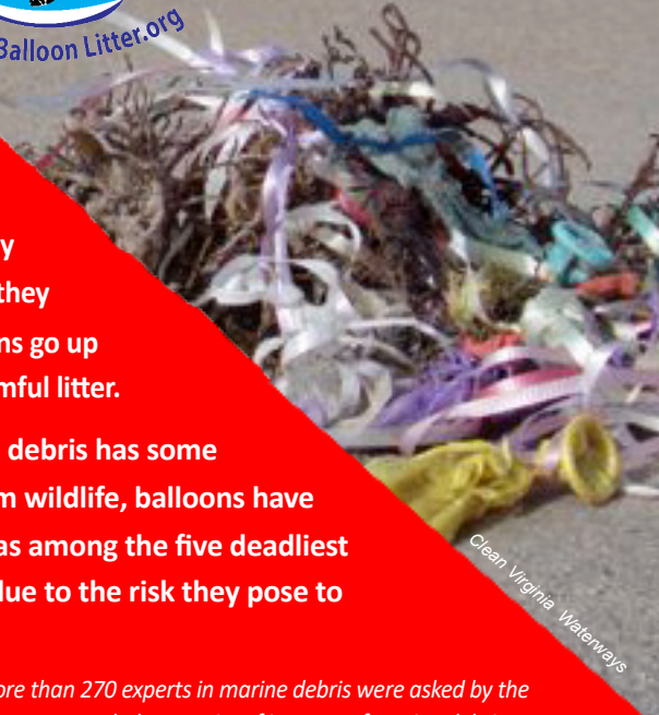
Clean Virginia - Waterways

Graphic at left - More than 270 experts in marine debris were asked by the Ocean Conservancy to rank the severity of impacts of marine debris on seabirds, sea turtles and marine mammals. Balloons were ranked number three due to the likelihood of entanglement or ingestion by marine life.